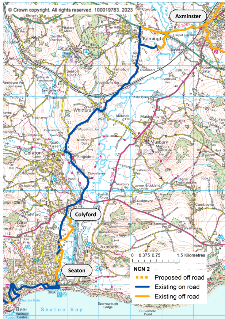
Figure 2: Existing and proposed NCN2 route between Seaton and Axminster

generate public health benefits by encouraging the growing culture of walking and cycling in Devon.